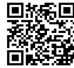
CPC Sermon Page