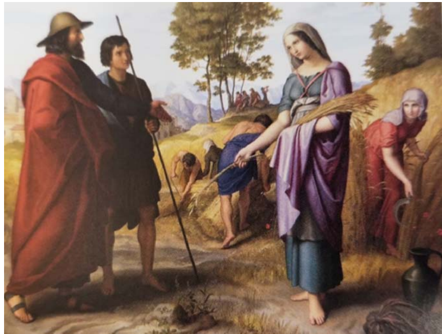
"Ruth in Boaz's Field" by German painter Julius Schnorr (1828)