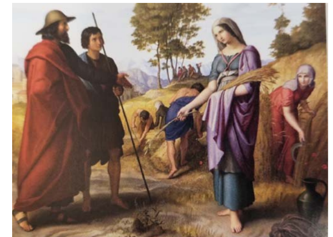
“Ruth in Boaz's Field” by German painter Julius Schnorr (1828)