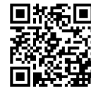
CPC Sermon Page