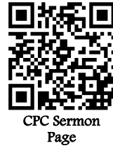
CPC Sermon Page