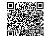
Scan for Designated Fund

Offertory Hymn "Come, Thou Fount of Every Blessing" (C11)