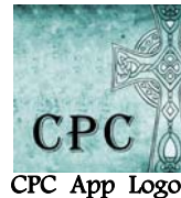
CPC App Logo

to all who are spiritually weary and seek rest; to all who mourn and long for comfort; to all who struggle and need strength; to all who sin and need a Savior; to all who are strangers and want fellowship; to all who hunger and thirst after righteousness; to all who will come, this church opens wide her doors and offers welcome in the name of the Lord Jesus Christ!