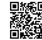
CPC Sermon Page