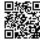
CPC Sermon Page