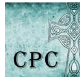
CPC App Logo

to all who are spiritually weary and seek rest; to all who mourn and long for comfort; to all who struggle and need strength; to all who sin and need a Savior; to all who are strangers and want fellowship; to all who hunger and thirst after righteousness; to all who will come, this church opens wide her doors and offers welcome in the name of the Lord Jesus Christ!