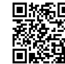
CPC Sermon Page