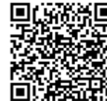
Scan for Designated Fund

Offertory Hymn "How Great Is Our God" (4)