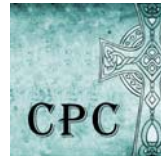
CPC App Logo

to all who are spiritually weary and seek rest; to all who mourn and long for comfort; to all who struggle and need strength; to all who sin and need a Savior; to all who are strangers and want fellowship; to all who hunger and thirst after righteousness; to all who will come, this church opens wide her doors and offers welcome in the name of the Lord Jesus Christ!