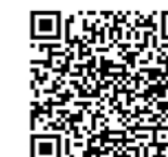
Scan for Designated Fund