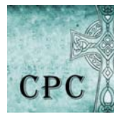
CPC App Logo

to all who are spiritually weary and seek rest; to all who mourn and long for comfort; to all who struggle and need strength; to all who sin and need a Savior; to all who are strangers and want fellowship; to all who hunger and thirst after righteousness; to all who will come, this church opens wide her doors and offers welcome in the name of the Lord Jesus Christ!