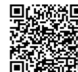
Scan for Designated Fund

Offertory Hymn "The Lord's My Shepherd, I'll Not Want" (T86)