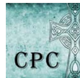
CPC App Logo

to all who are spiritually weary and seek rest; to all who mourn and long for comfort; to all who struggle and need strength; to all who sin and need a Savior; to all who are strangers and want fellowship; to all who hunger and thirst after righteousness; to all who will come, this church opens wide her doors and offers welcome in the name of the Lord Jesus Christ!