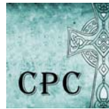
CPC App Logo

to all who are spiritually weary and seek rest; to all who mourn and long for comfort; to all who struggle and need strength; to all who sin and need a Savior; to all who are strangers and want fellowship; to all who hunger and thirst after righteousness; to all who will come, this church opens wide her doors and offers welcome in the name of the Lord Jesus Christ!