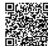
Scan for Designated Fund

Offertory Hymn "All Glory, Laud, and Honor" (T235)