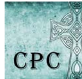
CPC App Logo

to all who are spiritually weary and seek rest; to all who mourn and long for comfort; to all who struggle and need strength; to all who sin and need a Savior; to all who are strangers and want fellowship; to all who hunger and thirst after righteousness; to all who will come, this church opens wide her doors and offers welcome in the name of the Lord Jesus Christ!