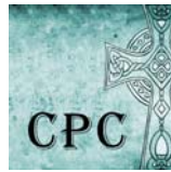
CPC App Logo

to all who are spiritually weary and seek rest; to all who mourn and long for comfort; to all who struggle and need strength; to all who sin and need a Savior; to all who are strangers and want fellowship; to all who hunger and thirst after righteousness; to all who will come, this church opens wide her doors and offers welcome in the name of the Lord Jesus Christ!