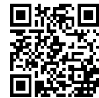
CPC Sermon Page