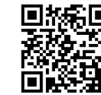
CPC Sermon Page

“Romans (16): A Gospel Introduction ~ I (16)”