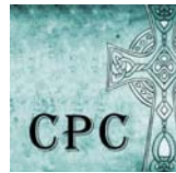
CPC App Logo

to all who are spiritually weary and seek rest; to all who mourn and long for comfort; to all who struggle and need strength; to all who sin and need a Savior; to all who are strangers and want fellowship; to all who hunger and thirst after righteousness; to all who will come, this church opens wide her doors and offers welcome in the name of the Lord Jesus Christ!