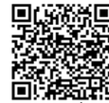
Scan for Designated Fund

Offertory Hymn "Be Thou My Vision" (T642)