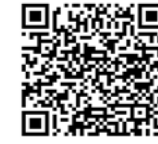
Scan for Designated Fund

COVENANT FAMILY BIRTHDAYS & ANNIVERSARIES THIS WEEK: