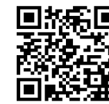
CPC Sermon Page

Romans (23): A Gospel Preaching Introduction ~ A (23)