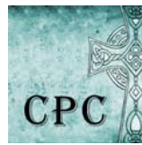
CPC App Logo

to all who are spiritually weary and seek rest; to all who mourn and long for comfort; to all who struggle and need strength; to all who sin and need a Savior; to all who are strangers and want fellowship; to all who hunger and thirst after righteousness; to all who will come, this church opens wide her doors and offers welcome in the name of the Lord Jesus Christ!