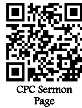
CPC Sermon Page