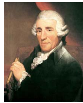
Tune: Franz Joseph Haydn