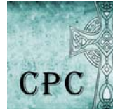
CPC App logo

Download the Covenant Presbyterian Church App from the Apple Store, Google Play or the link on the church website