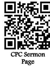
CPC Sermon Page