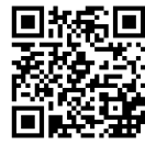
CPC Sermon Page