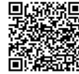
Scan for Designated Fund

Offertory Hymn "Blessed Assurance" (Bulletin Insert)