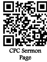
CPC Sermon Page