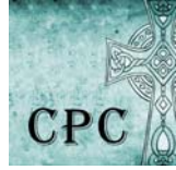
CPC App logo

Download the Covenant Presbyterian Church App from the Apple Store, Google Play or the link on the church website