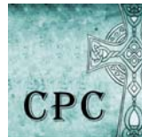
CPC App logo

to all who are spiritually weary and seek rest; to all who mourn and long for comfort; to all who struggle and need strength; to all who sin and need a Savior; to all who are strangers and want fellowship; to all who hunger and thirst after righteousness; to all who will come, this church opens wide her doors and offers welcome in the name of the Lord Jesus Christ!