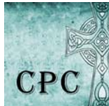
CPC App logo

to all who are spiritually weary and seek rest; to all who mourn and long for comfort; to all who struggle and need strength; to all who sin and need a Savior; to all who are strangers and want fellowship; to all who hunger and thirst after righteousness; to all who will come, this church opens wide her doors and offers welcome in the name of the Lord Jesus Christ!