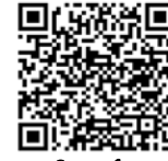
Scan for Designated Fund