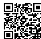
CPC Sermon Page

"God's Judgment and Man's Depravity (E)"