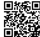
CPC Sermon Page