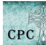
CPC App logo

to all who are spiritually weary and seek rest; to all who mourn and long for comfort; to all who struggle and need strength; to all who sin and need a Savior; to all who are strangers and want fellowship; to all who hunger and thirst after righteousness; to all who will come, this church opens wide her doors and offers welcome in the name of the Lord Jesus Christ!